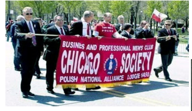
Polish Constitution Day Parade