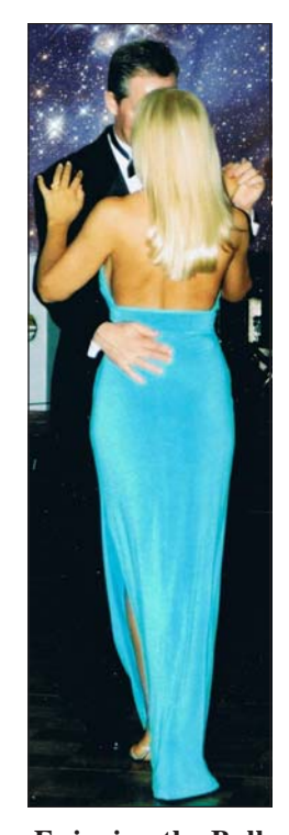
Enjoying the Ball

The menu will consist of a soup – sherry mushroom bisque, a salad – bouquet of baby lettuces with dried cranberries and walnuts wrapped in English cucumber with passed balsamic vinaigrette, and a choice of entrée - center cut