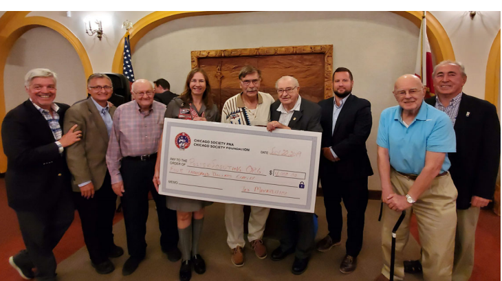
More pictures from the Polish Scouting Organization's "Kolonia"