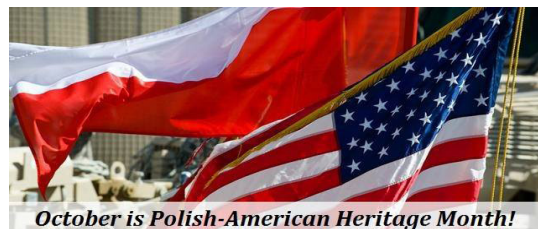
October is Polish-American Heritage Month!